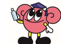
The Faculty of Pharmaceutical Sciences