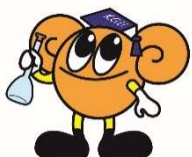
The Faculty of Nutrition

The target faculties of IPE are as follows.