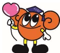
The Faculty of Rehabilitation