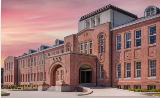
Seok-dang Museum & Gamcheon Village 8/4(Thurs)

Busan is a metropolitan city with nature, beaches, nightlife, Festivals, culture, food and much more!