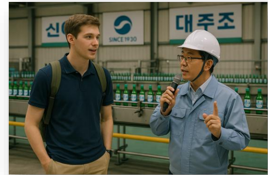
Local Distillery Factory Tour (Daeseon) 8/6(Thurs)