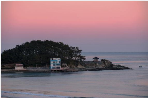
Songjeong Beach (Mipo Train Tour) 8/13(Wed)