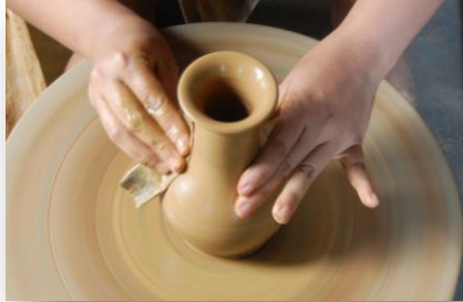
Making Pottery 8/6(Wed)