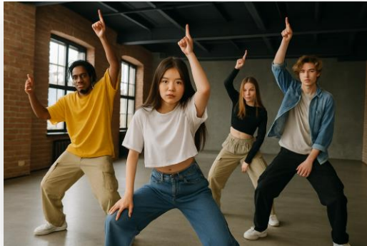
Learning K-pop Dance 8/11(Thurs)