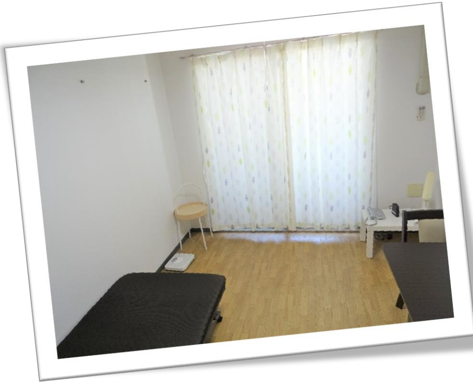
Singled bed Dining table and 2 chairs