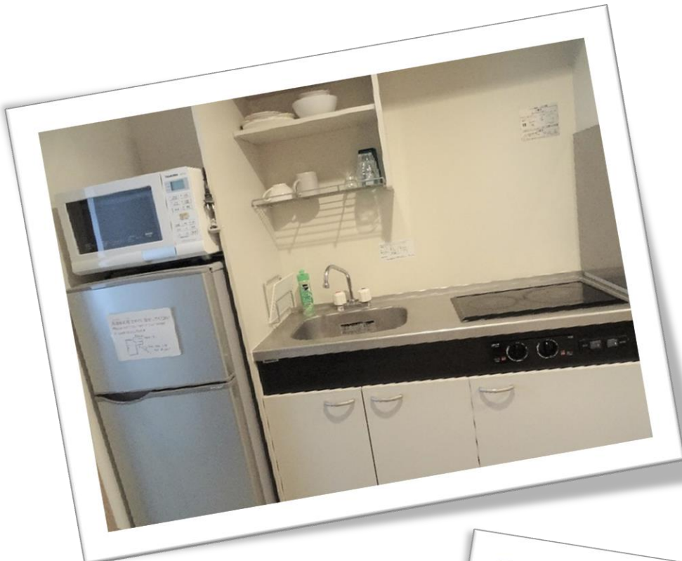
Refrigerator Microwave Electric kettle