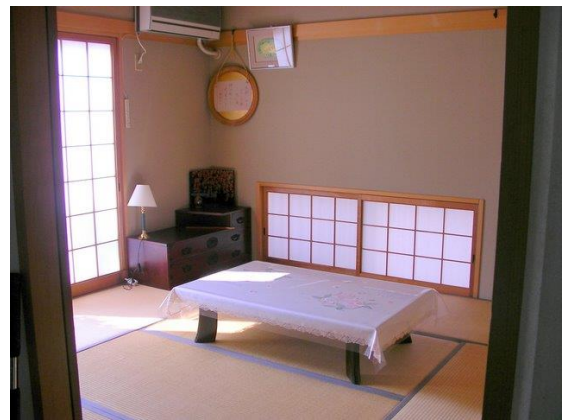
" washitsu " or tatami mat room