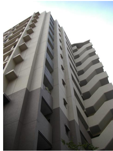
Typical " Mansion " or Condominium