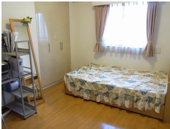
Typical single room